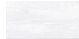
AVE 90A grau glänzend grey glossy