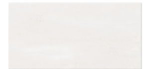
AVE 93A beige matt beige mat